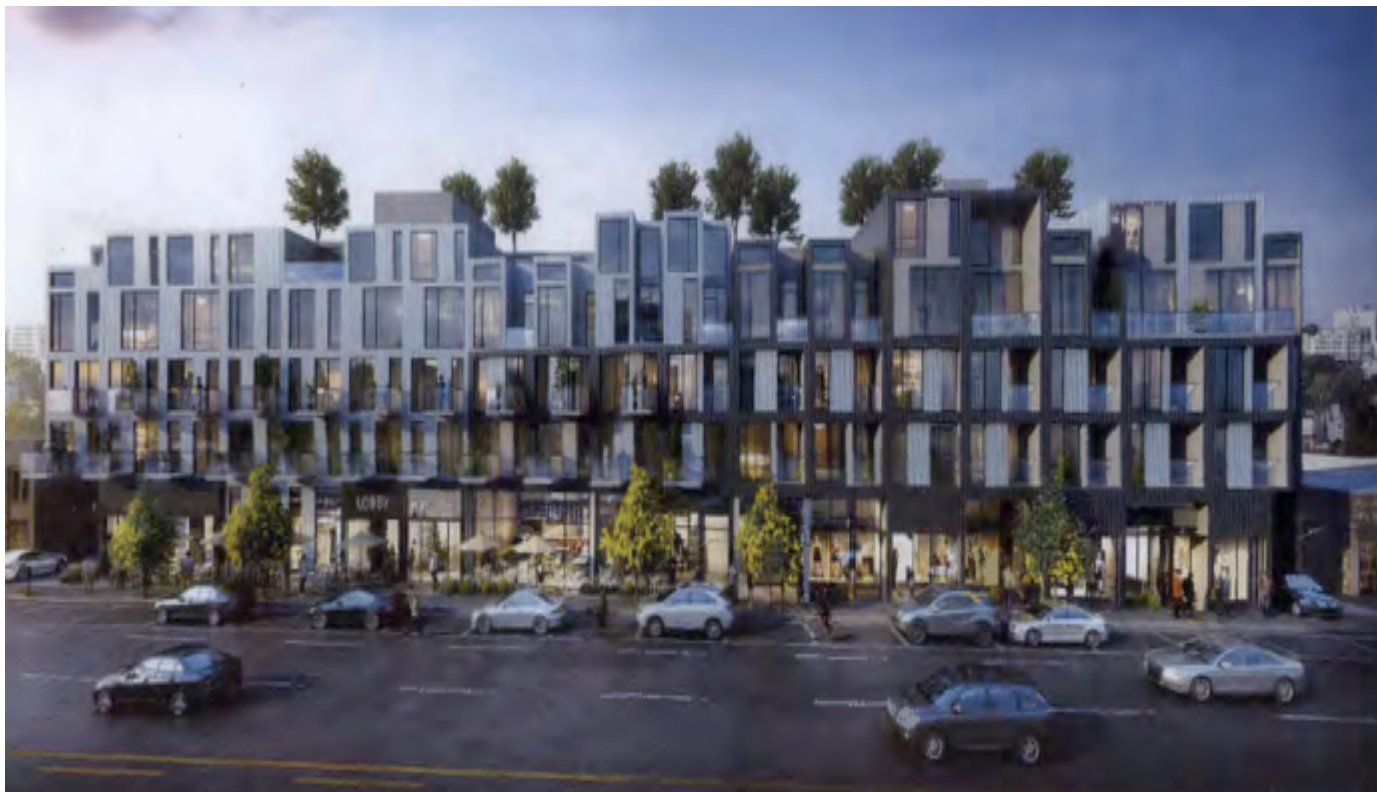
Rendering of RYDA’s approved 104-unit project at 3301-3327 Sunset Blvd.